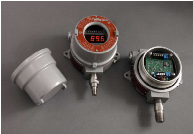
Sensor and gauge with & without optional digital display. Both provide 4 - 20 mA and 0-10 VDC output. Enclosures meet ATEX 95 equipment directive 94/9/EC requirements for Apparatus Group II, Categories 2G/2D: II 2 G EEx e II T3-T4; II 2 G EEx D IIC T3-T4; II 2 D IP66 TI 10°C - T140°C.

VRC offers two approaches to measuring high vacuum in hazardous areas. The first is with the sensor, gauge and optional display built into a Killark enclosure approved by UL, CSA and FM. ATEX certificate is provided with all gauges. All gauges provide both 4-20 mA and 0-10 VDC linear outputs. The alternate approach described at the bottom of this page is to have only the sensor located in the hazardous area with the gauge and display located in a non-hazardous area that can be up to 500 feet away. Power required is 15 to 35 VDC.