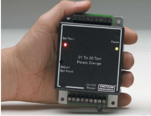
Available in 5 ranges from 10-5 Torr to 1500 Torr. Pirani and Stainless Steel Diaphragm Sensors.