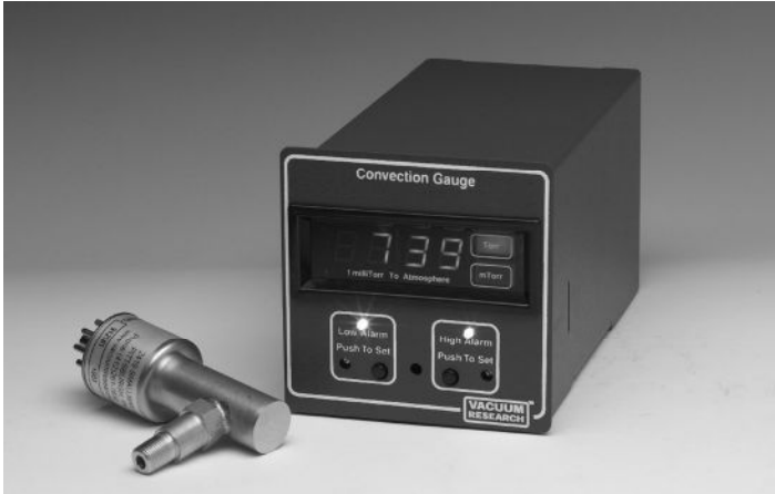
Photo shows digital Convection Gauge Controller with two adjustable setpoints and angle style 1/8" NPT gauge tube