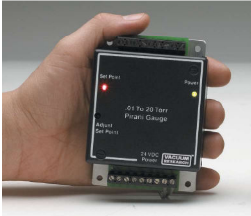
Available in 5 ranges from 10-5 Torr to 1500 Torr. Pirani and Stainless Steel Diaphragm Sensors.

Vacuum and Pressure Atmospheric pressure as reference, reads zero at atmosphere. Choose Any Unit Calibration in PSIG, in. Hg, In. H 2 O, mm Hg. Choose Any Range Some standard ranges are shown below, but any range is available. Best Value Gauges Although low in cost these rugged instruments include all the features you need. Adjustable set point, analog output and more. Diaphragm Sensors are available with any flange style: NW, NPT, VCR, VCO, etc. Digital Display (optional) 3 1/2 place LCD gives high resolution over entire gauge range. Millisecond Response for Alarm Built in relay and set point provide msec. response for alarm; adjustable relay does not have to wait for slow scanning data systems. Cable Length to 500 feet Add or change the cable length between sensor and gauge up to 500 Ft. (150m) No affect on calibration. Control or Alarm These gauges provides an inexpensive and straightforward way to control your vacuum system. Use the adjustable set point with built-in relay to control backfill pressure on pump and purge operations. Or, feed the Fast Response analog output into your PC or PLC and let the digital system make the control decisions based on the signal.