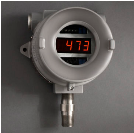
Dust and Water Proof Enclosure Rated IP-65