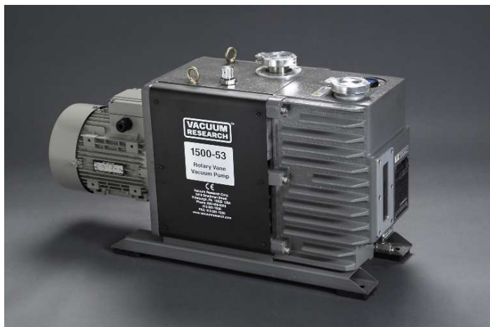
Model 1500-53 has NW-40 flanges for inlet and exhaust ports