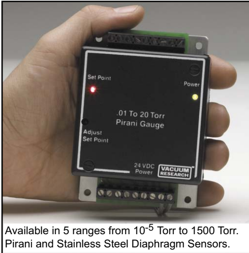
Available in 5 ranges from 10 -5 Torr to 1500 Torr. Pirani and Stainless Steel Diaphragm Sensors.