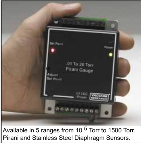
Available in 5 ranges from 10^{-5} Torr to 1500 Torr. Pirani and Stainless Steel Diaphragm Sensors.