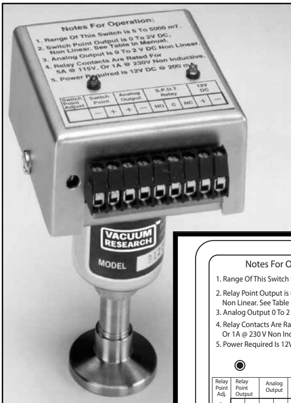
Gauge Tube Mount Active switch shown on Pirani tube with NW-16 Flange. 1/8" NPT, VCR & Conflat® also available.