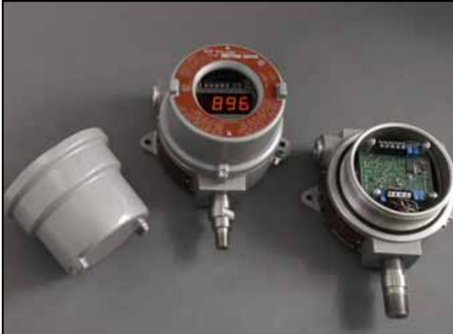
Sensor and gauge with & without optional digital display. Both provide 4 - 20 mA and 0-10 VDC output. Enclosures meet ATEX 95 equipment directive 94/9/EC requirements for Apparatus Group II, Categories 2G/2D: II 2 G EEx e II T3-T4; II 2 G EEx D IIC T3-T4; II 2 D IP66 TI 10°C - T140°C.

VRC offers two approaches to measuring high vacuum in hazardous areas. The first is with the sensor, gauge and optional display built into a Killark enclosure approved by UL, CSA and FM. ATEX certificate is provided with all gauges. All gauges provide both 4-20 mA and 0-10 VDC linear outputs. The alternate approach described at the bottom of this page is to have only the sensor located in the hazardous area with the gauge and display located in a non-hazardous area that can be up to 500 feet away. Power required is 15 to 35 VDC.