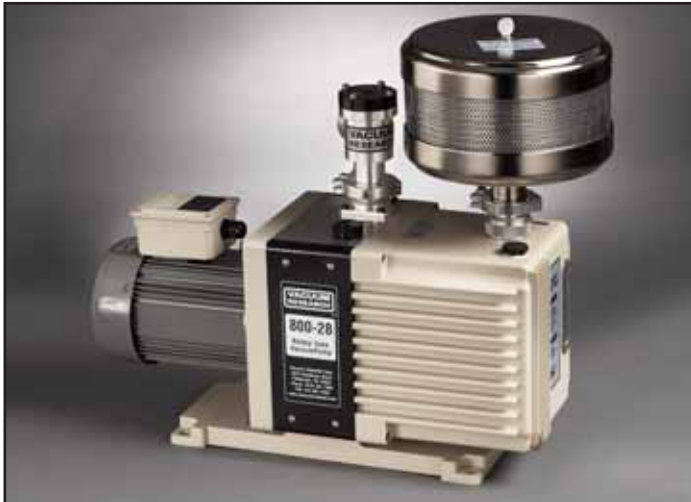
Photo shows Pump with optional inlet trap and exhaust mist eliminator installed. See pages 14 and 15 to order these accessories.