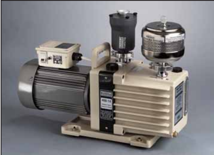
Photo shows Pump with optional inlet trap and exhaust mist eliminator installed. See pages 14 and 15 to order these accessories.