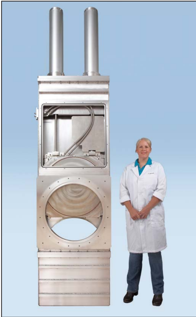
ISO 600 Valve with Water Cooled Gate