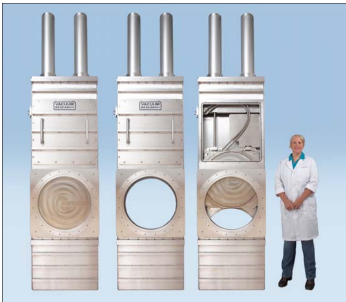
ISO 600 Powder and Chunk with Water Cooled Gate

Our protective ring valves are operating in multiple process configurations. We are especially proud of our success in large valve production of the Protective Ring Valves and we'd like the opportunity to meet your requirements. Call or email us with your application design. Our engineering and production teams can work with you to fit our valve to your process. We may already have designed a valve that is close to fitting your system and we can work with you on the details to finish the job.