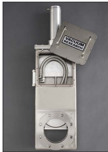
Water Cooled Gate and Port Flanges