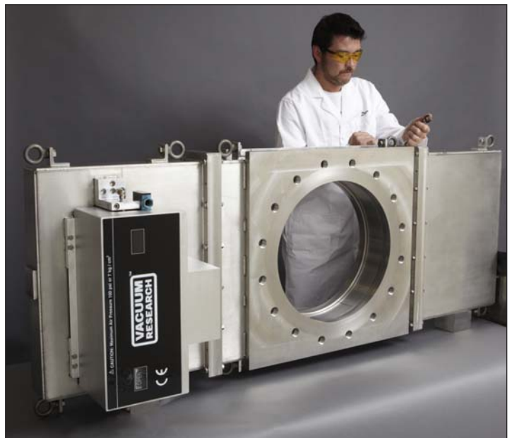
500 mm Powder and Chunk Valve Final Assembly