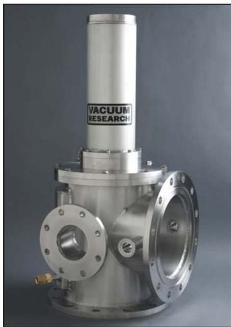
Poppet Valve with Cooling Shroud

Water cooled valves in both gate and poppet styles are available with ANSI flanges up to 32 inches and with ISO flanges up to 800 mm. Highly efficient cooling water circuits with low \Delta P and high overall 'u' maximize thermal transfer and minimize cooling water consumption. In addition to water cooling all valve styles can be provided with thermal radiation shields on the gate.