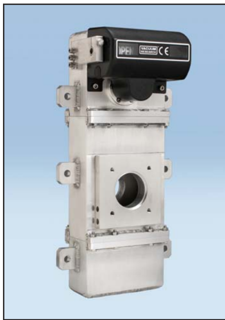
Water Cooled Flanges with Port Shroud