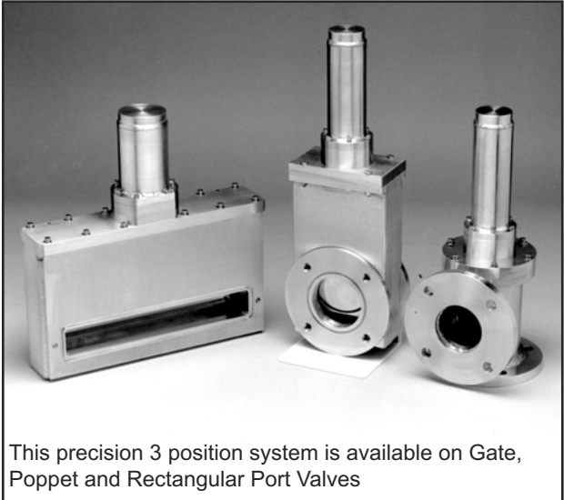
This precision 3 position system is available on Gate, Poppet and Rectangular Port Valves