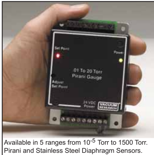
Available in 5 ranges from 10 -5 Torr to 1500 Torr. Pirani and Stainless Steel Diaphragm Sensors.