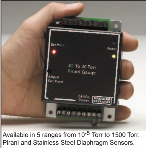
Available in 5 ranges from 10 -5 Torr to 1500 Torr. Pirani and Stainless Steel Diaphragm Sensors.